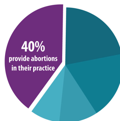
ABORTION PRACTICE OF RYAN RESIDENCY GRADUATE OB-GYN PHYSICIANS (N=464)

Residents who receive routine abortion training are more likely to provide comprehensive reproductive health care after graduation, including pregnancy options counseling , abortion referrals , abortion care , and comprehensive early pregnancy loss care .